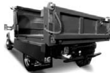
Marauder Dump Bodies Standard & Drop-Side