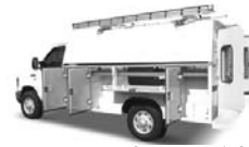
Aluminum Pinnacle Service Van (PSV)