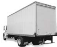
Dry Freight Bodies